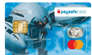
Gamer - Mastercard Youth Card for users aged 16 and over